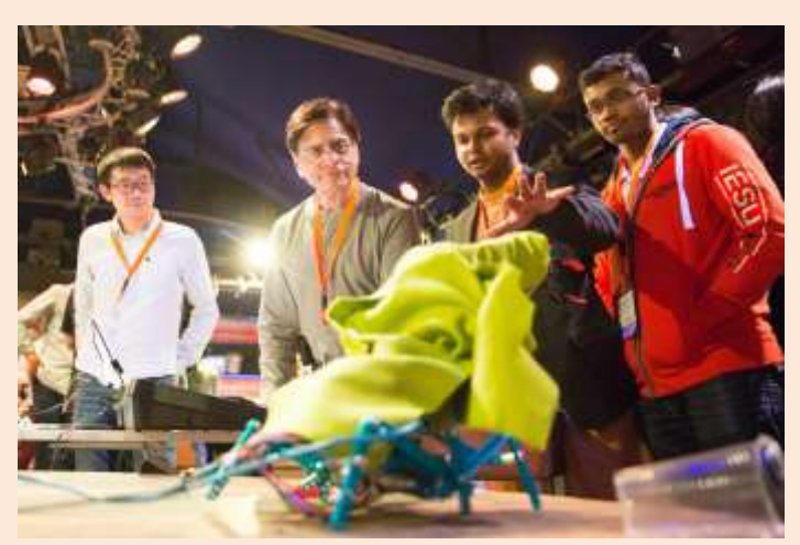
Expressive bot: The innovation is based on the concept of Animatronics

The puppet has a head and a beak and can move around, pick up objects and drop it off. "The innovation is not the object itself, but the way it is controlled," says Varnith, and adds, "For example, when we tell it to walk forward, it can either walk briskly with its head raised or in a slow and gloomy manner. That is determined by the music that is being played."