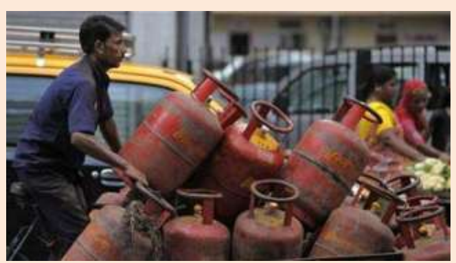
IIT, Kharagpur have devised a computer programme that will help maximise LPG connections in BPL households in the 'Pradhan Mantri Ujjwala Yojana',

The DSS mathematical model devised at IIT KGP has found the optimum number of total (BPL) connections required in a region and the number of dealerships that need to be commissioned in a region over the policy time frame, the statement said.